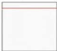
One Gallon Plastic Freezer Bag