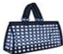
Patterned Plastic Bag