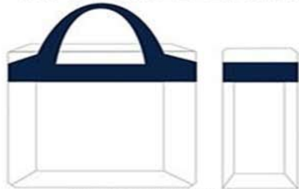
Clear Plastic Bag (No larger than 14" x 6" x 14")