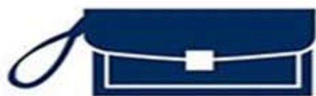
Clutch With or Without Shoulder Strap (No larger than 5" x 8")